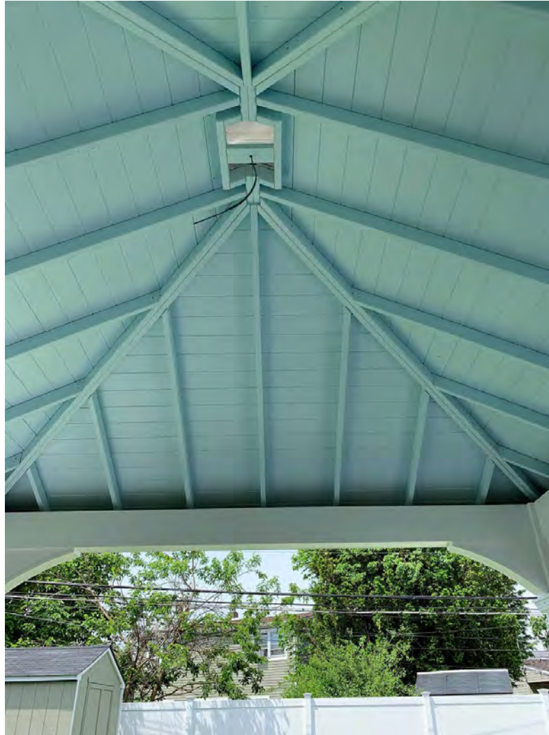
14x16 Vinyl Traditional (hip) Roof. Painted with Benjamin Moore 2054-70 Clear Skies. Levittown, NY