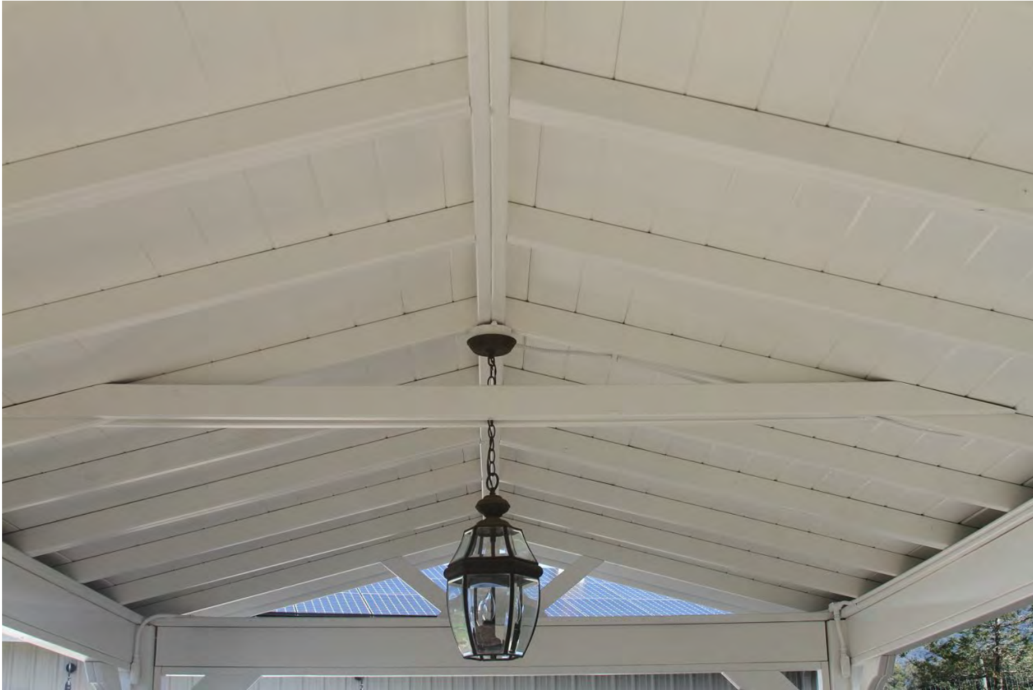
11x20 Pressure Treated Open Gable, 3:12 roof pitch, white paint, Napa, CA