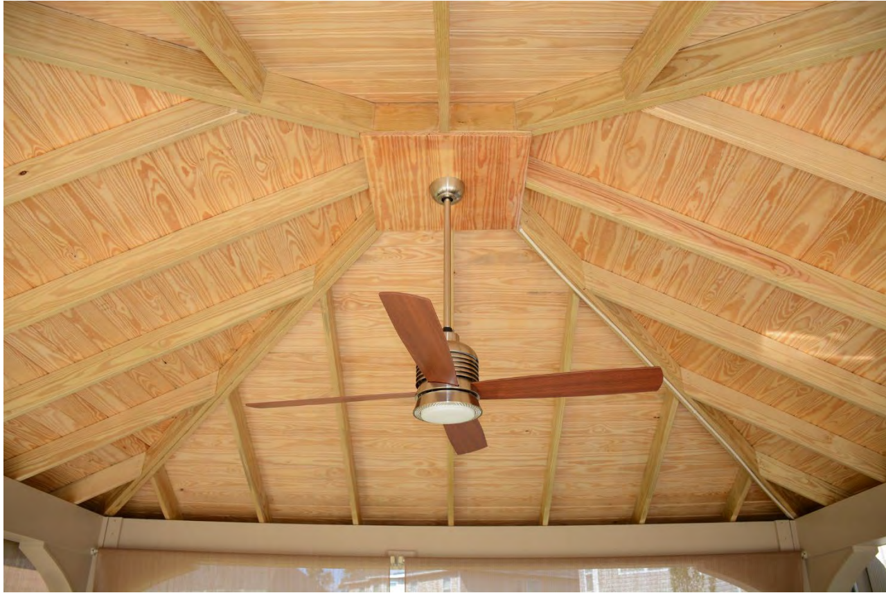
16x16 Vinyl Hip, unstained, Lexington, SC