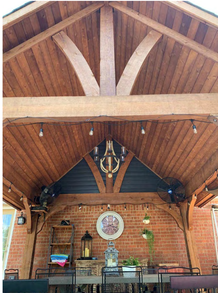
14x14 Grand Cedar Pavilion, 12:12 roof pitch, optional cedar tongue and groove ceiling, stained, Oklahoma City, OK