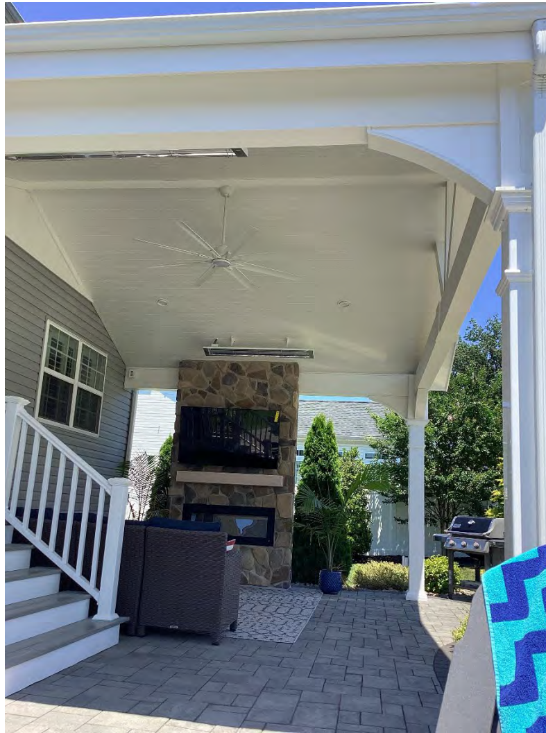
Wall-mounted vinyl gable pavilion, optional vinyl ceiling, Milton, GA