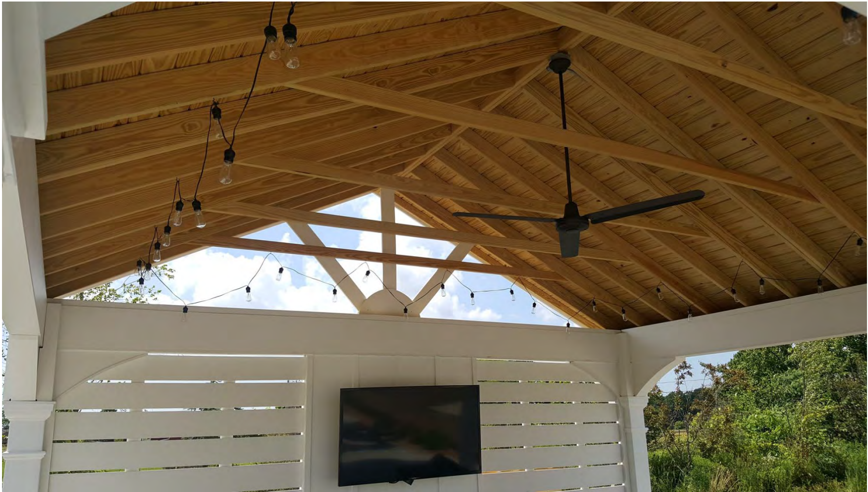
19x17 Vinyl Open Gable, Grandville, MI