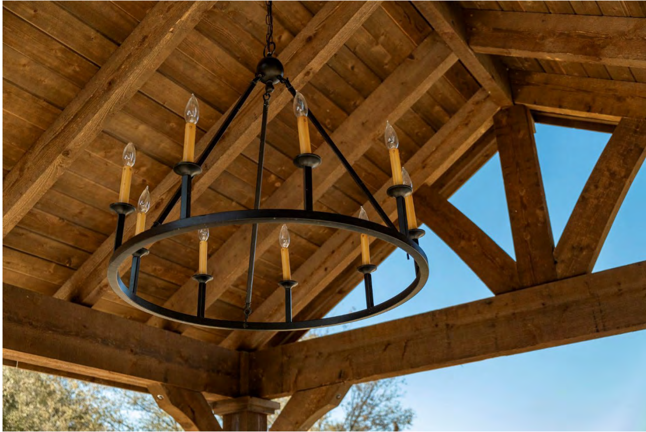
14x16 Grand Cedar, Walnut Stain, Seminole, OK