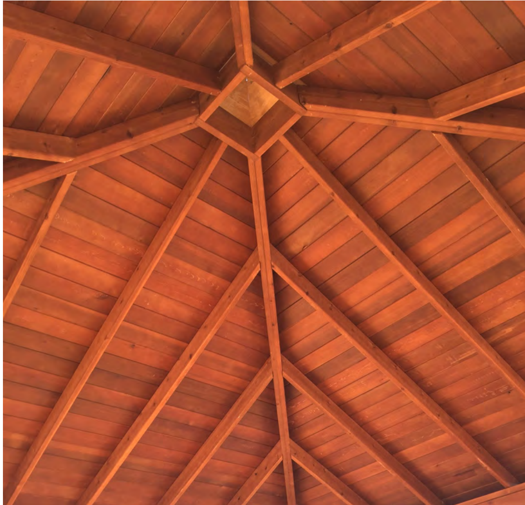
20x20 Red Cedar Trad'l (hip) Roof, Rustic Cedar color, McCamey, LA