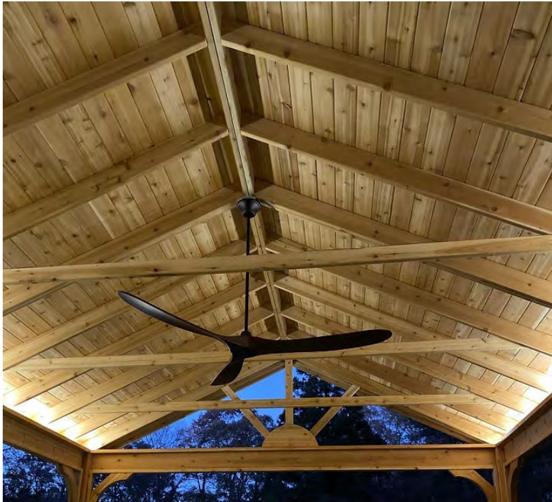
Red Cedar Gable Roof 16x20, unstained, White Plains, MD

On the following page are some photos of the many stain and paint options we offer for our structures.