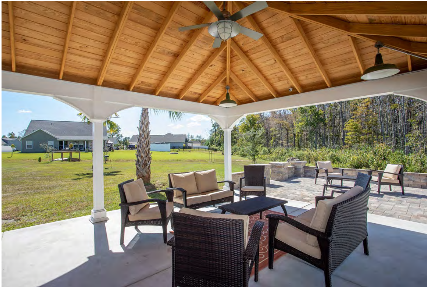
16x24 Vinyl Hip, unstained, Myrtle Beach, SC