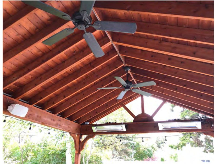
14x18 Red Cedar Gable Roof, Cedar Stain, York, MN