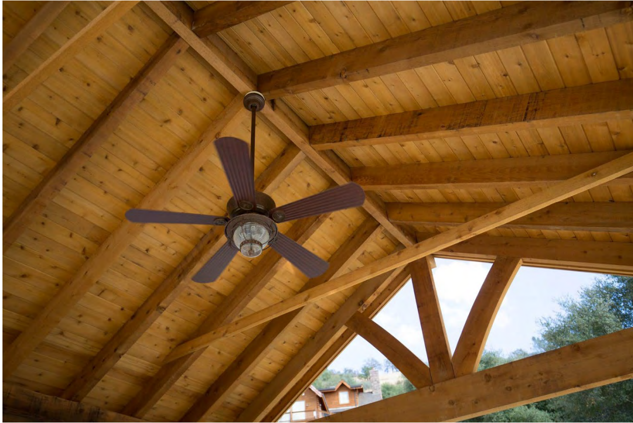
17x17 Grand Cedar, Maple color stain, Copperopolis, CA