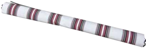
Canopy Assembly Includes Fabric and Arms