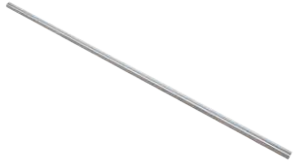
Aluminum Side Rail