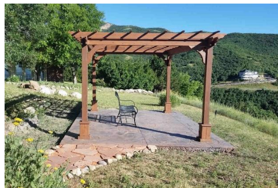
Classic Cedar Pergola 2x6 rafters and 2x2 runners 16" on center