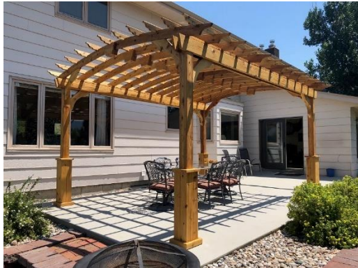
Arched Cedar Pergola 2x6 rafters and 2x4 runners 16" on center