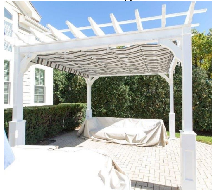
Sunbrella™ Fabric Retractable Canopy