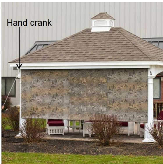
Side shade for pavilions