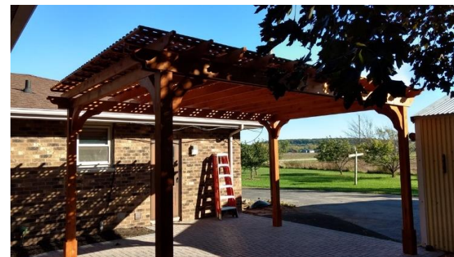
Classic Cedar Pergola 2x6 rafters 16" on center, lattice roof