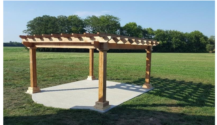
Thick shadows beside the pergola

3. Ideas for More Shade: If you want more shade, you may want to consider the following options: