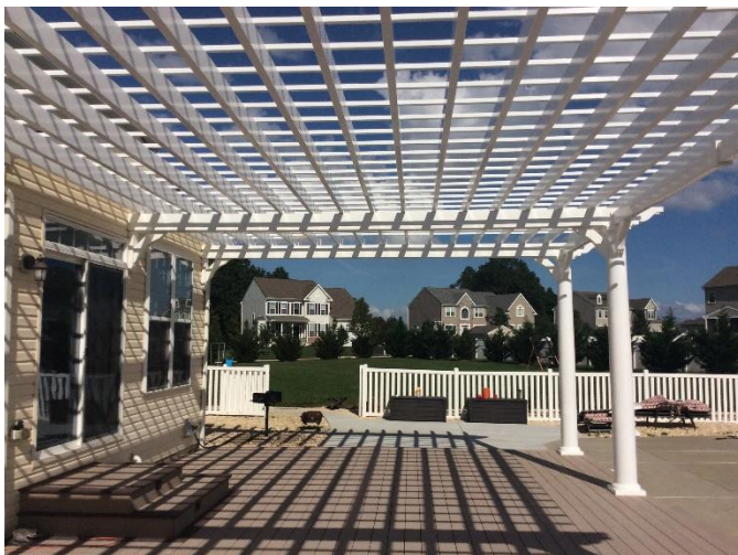
2x6 rafters 14" on center and 2x2 runners 12" on center