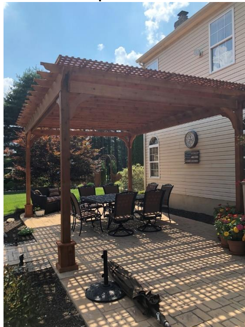
Two levels of 1x2's spaced 3 1/2" on center