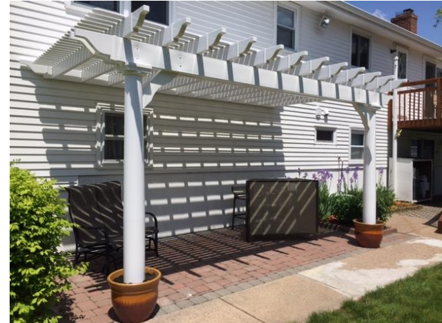
1x3 top runners 4" on center