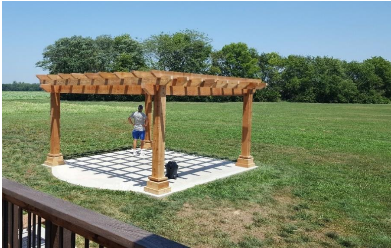
Thin shadows beneath the pergola