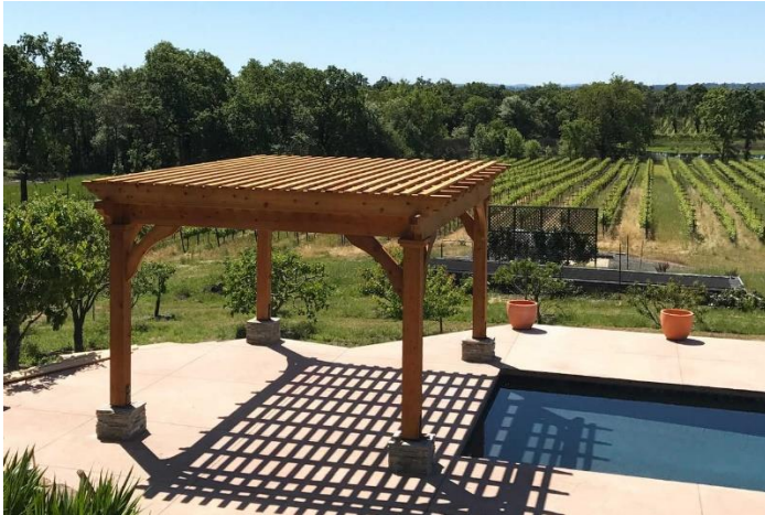
2x4 top runners 8" on center