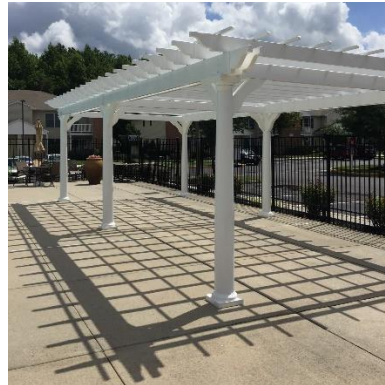
Classic Vinyl Pergola 2x6 rafters and 2x2 runners 16" on center