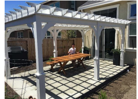
Serenity Cedar Pergola (painted white) 2x6 rafters and 2x4 runners 16" on center