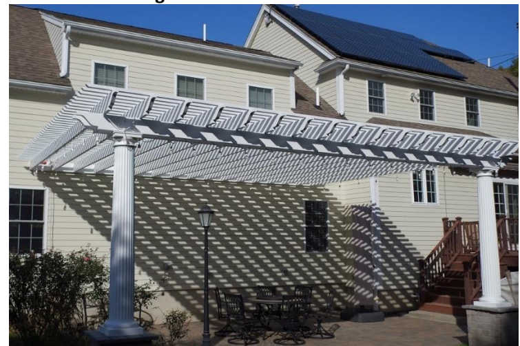
2x8 rafters 16" on center and 2x2 runners 6" on center