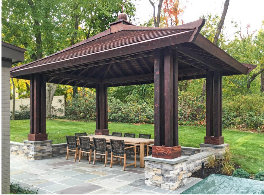
Custom Asian inspired design.