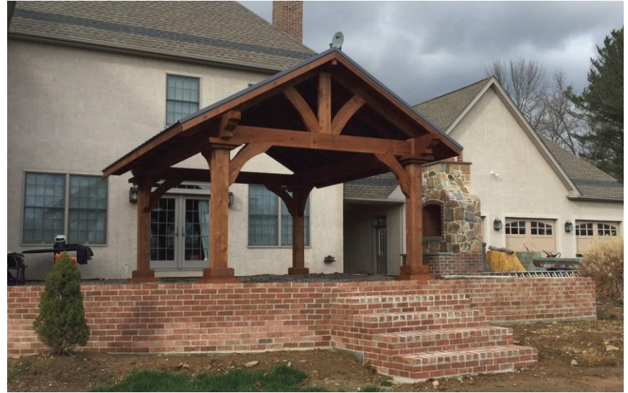
Above: 12x14 free standing backyard pavilion, oversize timbers.