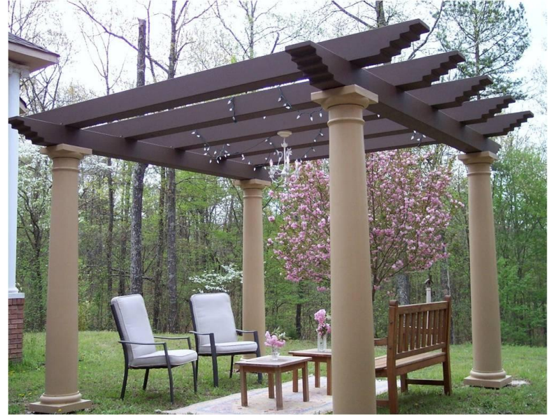
Above: Custom oversized rafters with unique decorative tail design. Left: Custom engineered coating, deep Mahogany.

On a per square foot basis, we price our custom designs below the cost of standard designs that are widely available.