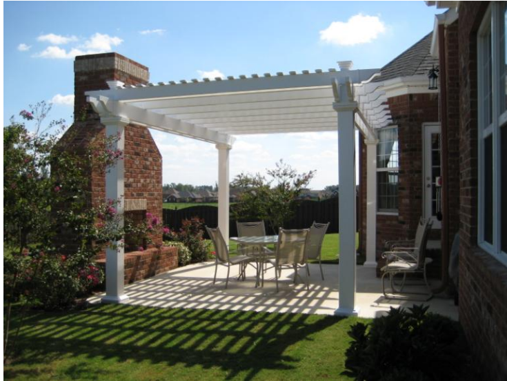
Hampton Free Standing Pergola - 8 Inch Square Columns

Our Hampton Pergola Kits are high quality vinyl pergolas, a step up in quality from standard vinyl kits sold through mass market retailers. Sold in three colors, they are the sturdiest vinyl pergolas on the market, capable of withstanding hurricane force winds up to 140 miles per hour, and snow loads four feet deep. The material of the Hampton Pergola has a high dose of UV inhibiting chemicals and carries a 20 year warranty , so you can rest comfortably in the knowledge that you are making an investment into your property that will last decades.