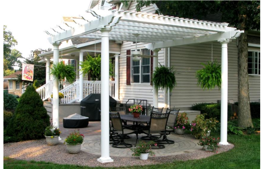
Hampton Free Standing Pergola - Round Tapered Columns