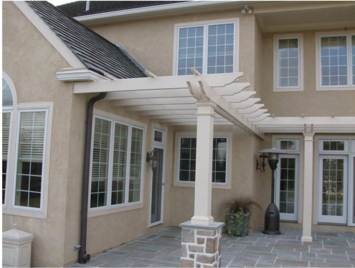
Above: 6x14 structural fiberglass, custom "L shape" .