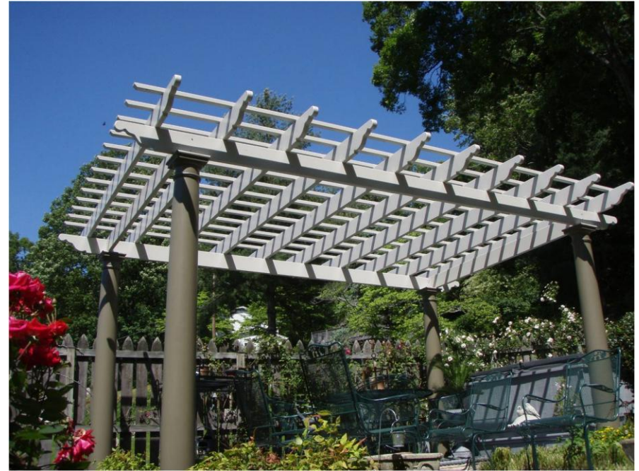
Custom fiberglass composite. Our fiberglass is available in any color. We use spectrometry to match your sample, and apply an engineered exterior coating that is warrantied for 20 years.